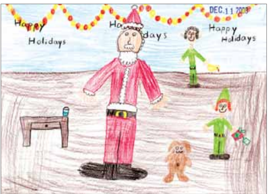
Kinley, Marsing Elementary