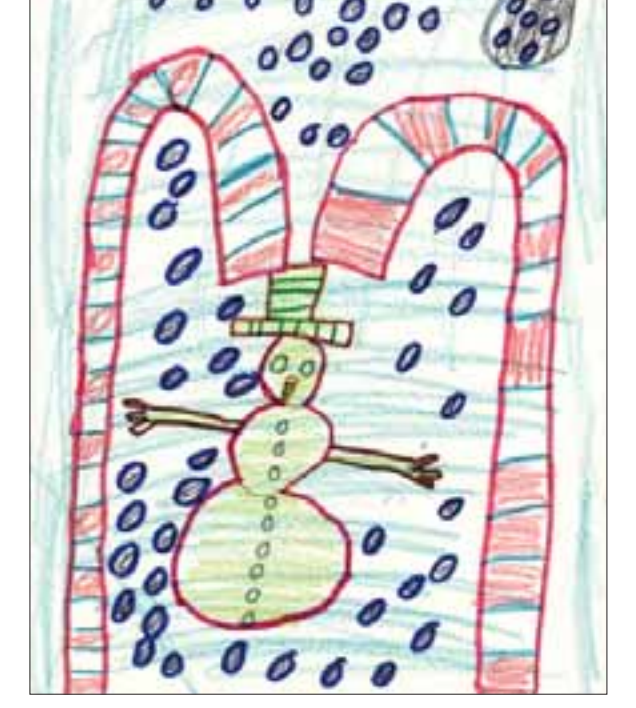
Dillon, Homedale Elementary